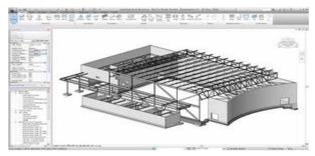
Figure 3 Architectural design presentation